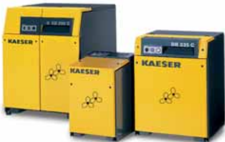
Rotary blowers with OMEGA PROFILE