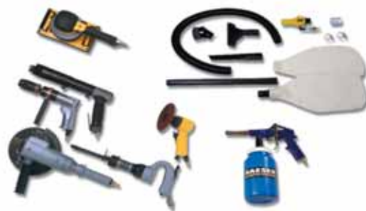
Air tools and accessories