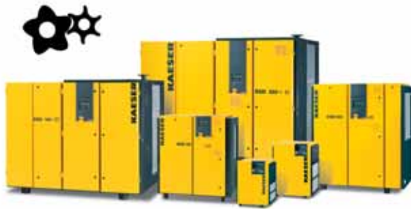
Rotary screw compressors with SIGMA PROFILE