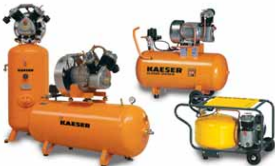
Reciprocating compressors for trade and industry