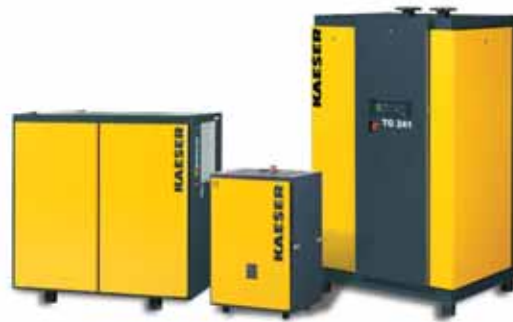
Refrigeration dryers with SECOTEC energy-saving control