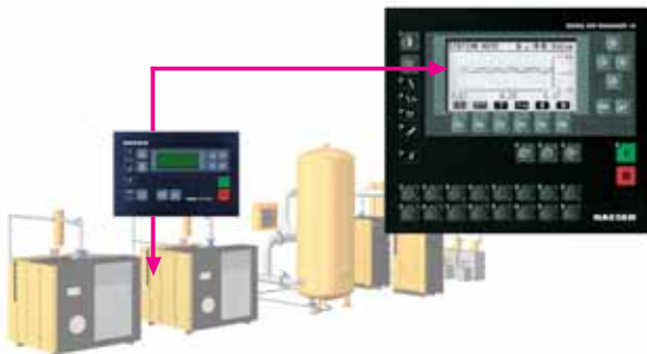
Compressor controllers using Internet technology