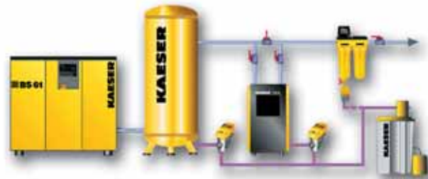
Air treatment (filters, condensate treatment, desiccant dryers, activated carbon adsorbers)