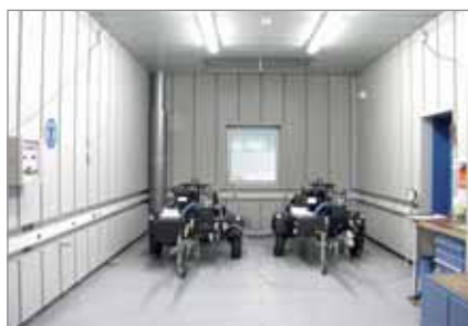
Mobilair units in the test room

The portable compressor production facility at KAESER's headquarters in Coburg