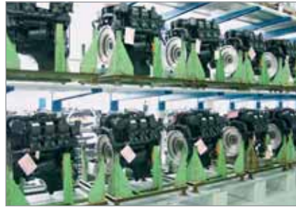
Drive motors in the high-stack warehouse await installation