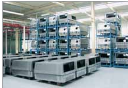
Enclosures for the portable compressors