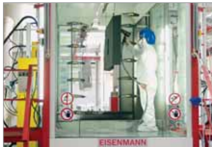
The machines get their tough paint finish in the powder-coating installation