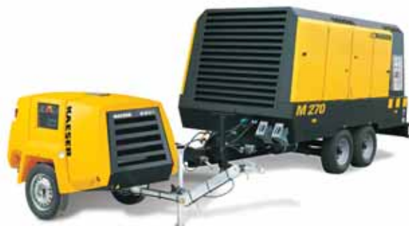
Portable compressors with SIGMA PROFILE